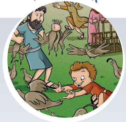
Israel rejects God's provisions Numbers 11:1-12:16