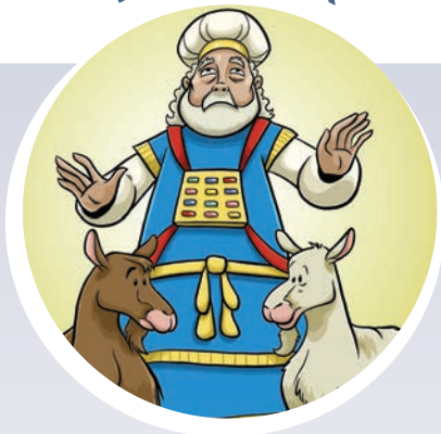
God Ordains the Day of Atonement Leviticus 16:1-34