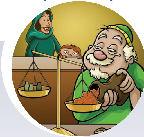
God requires holy living Leviticus 19:1-37